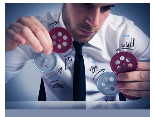
Autopilot Business Systems

characteristics can devalue the business and potential buyers don't want to buy a 'job' where the revenue is capped based on the hours the solopreneur works.